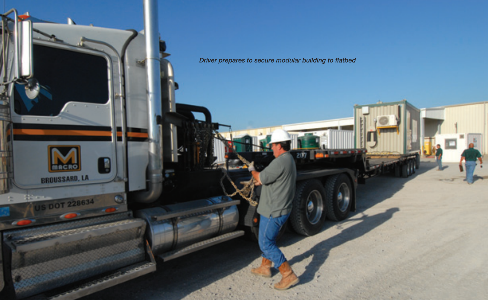
Driver prepares to secure modular building to flatbed