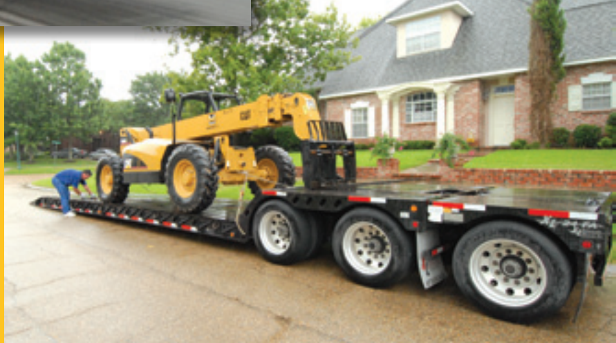
Removable Gooseneck (RGN) hauled this forklift to urban construction site