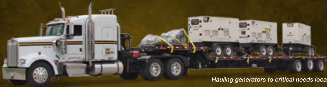
Hauling generators to critical needs location