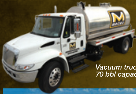
Vacuum truck with 70 bbl capacity

Macro Environmental Specialties offers vacuum trucks for the transportation of materials between locations. Our vacuum and pumping services include professional collection, transportation and disposal of non-hazardous waste, sludge and salt water.