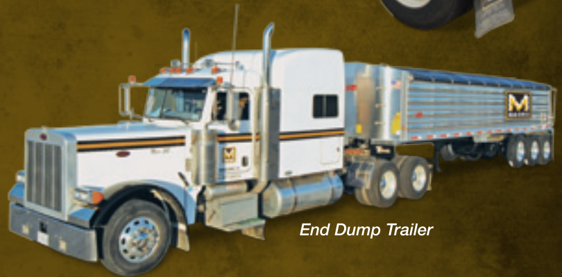
End Dump Trailer

Emergency Fuel Management provides emergency fuel, fuel dispensing equipment, logistics and management services during a wide range of disasters. As a division of Macro Oil, we own and operate the industry's largest dedicated fleet of fuel transportation and dispensing equipment.