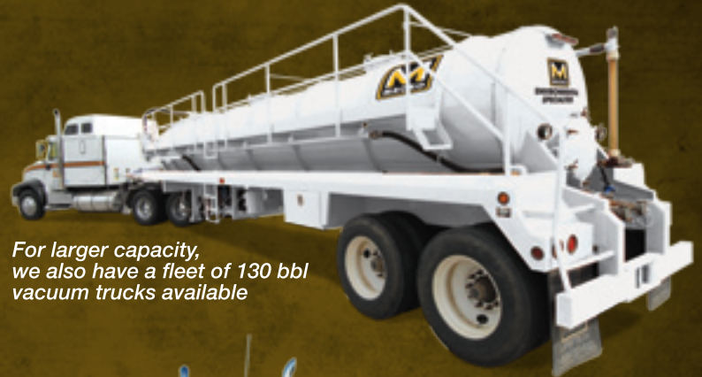
For larger capacity, we also have a fleet of 130 bbl vacuum trucks available