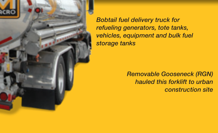
Bobtail fuel delivery truck for refueling generators, tote tanks, vehicles, equipment and bulk fuel storage tanks