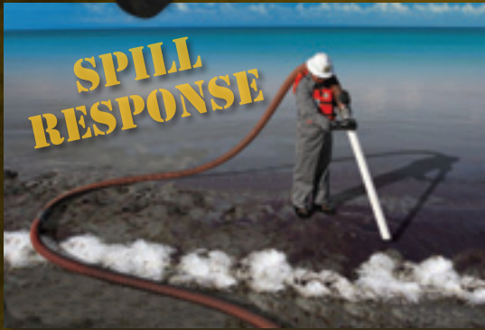
Our vacuum truck fleet is ready to respond to oil spills and other emergency situations that require vacuum truck services.