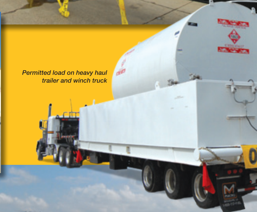
Permitted load on heavy haul trailer and winch truck