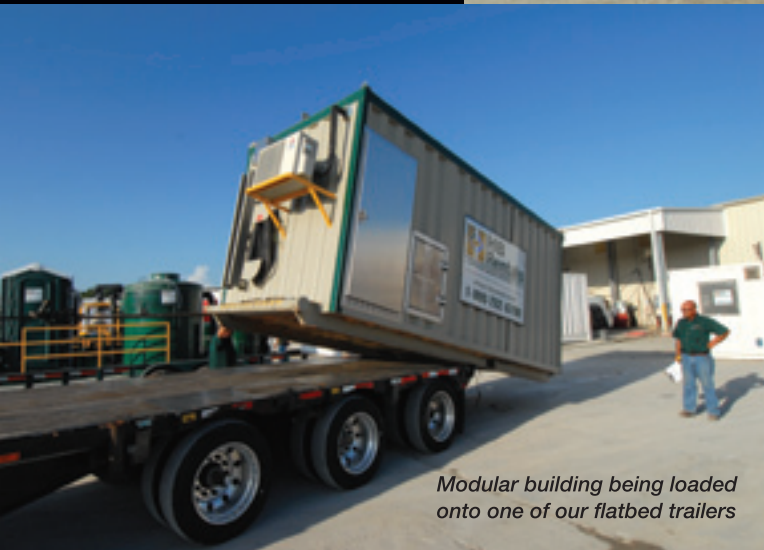
Modular building being loaded onto one of our flatbed trailers