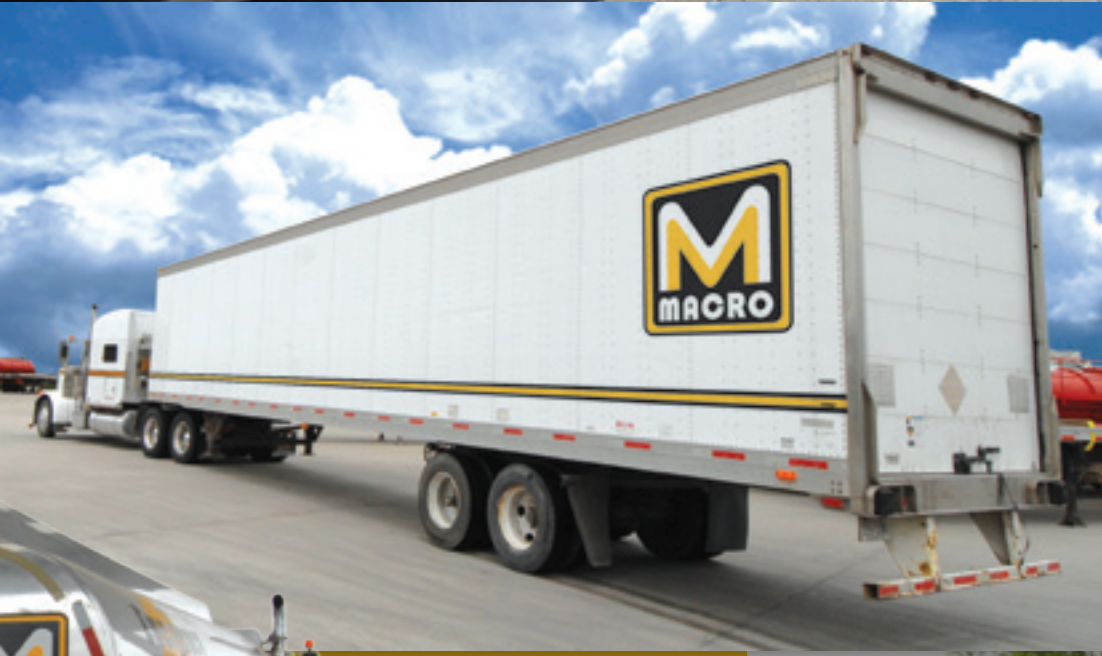
53-foot dry van trailer for transporting dry goods and equipment