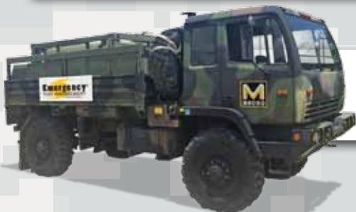
LMTV Fuel Truck with one fuel tank (900 gallon capacity). High volume pumping system. High water / all terrain capable.