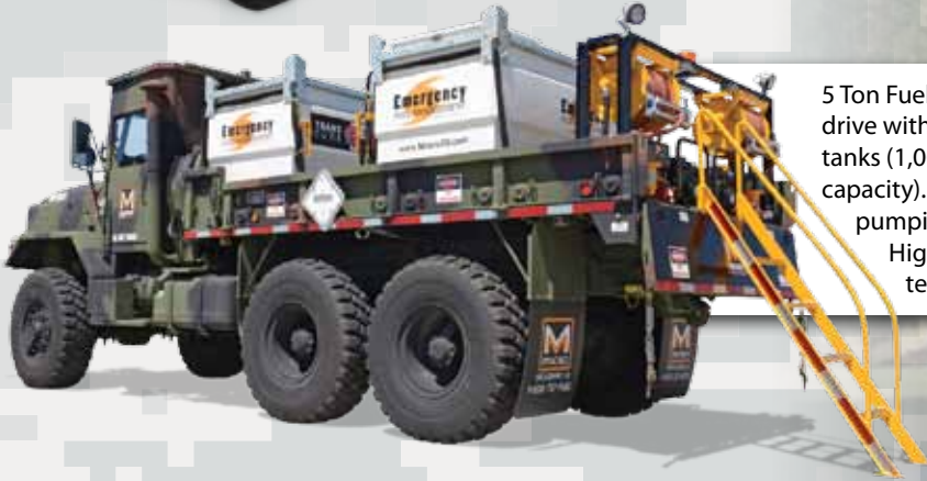
5 Ton Fuel Truck all wheel drive with two fuel tanks (1,000 gallon total capacity). High volume pumping system. High water / all terrain capable.