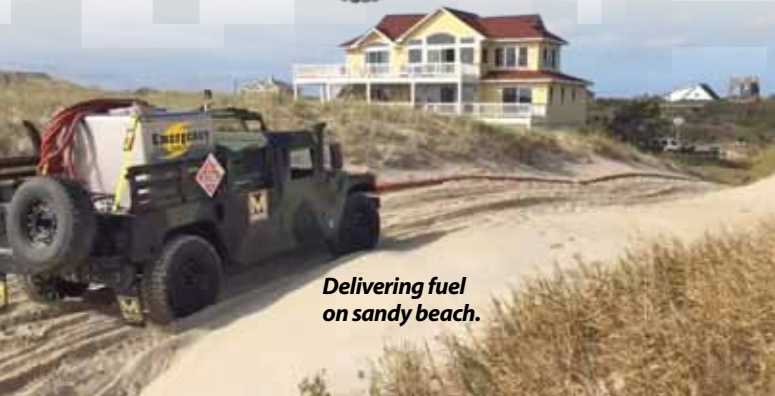
Delivering fuel on sandy beach.