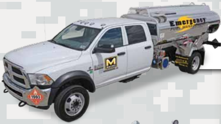
Bobtail Fuel Truck with 1,100 gallon capacity. Multi-compartments. High volume pumping system. Ideal in confined areas. Four wheel drive.