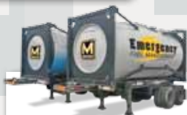
ISO tank (6,000 gallon capacity) with carriage.