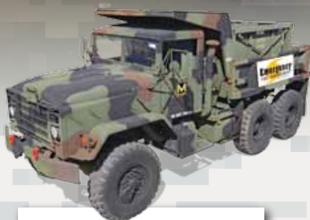
Military Dump Truck with one fuel tank (900 gallon capacity). High volume pumping system. High water / all terrain capable.

Macro's fleet of equipment can be used to deliver fuel for challenging missions such as high water, rough terrain, airlift operations and when locations are only accessible by watercraft