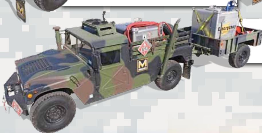
Military Style Utility Trailer with 350 gallon tank. High volume pump and backup 12 Volt Pump (Optional solar panel).