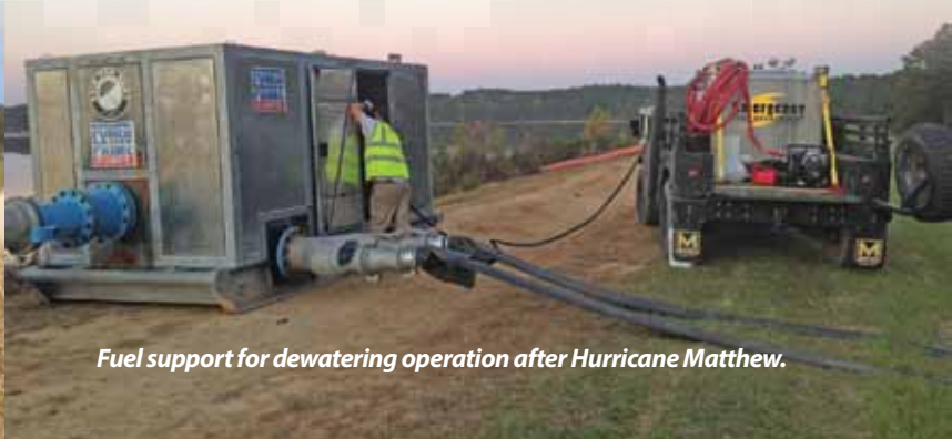
Fuel support for dewatering operation after Hurricane Matthew.