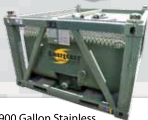
900 Gallon Stainless Steel Tank with pumping system.