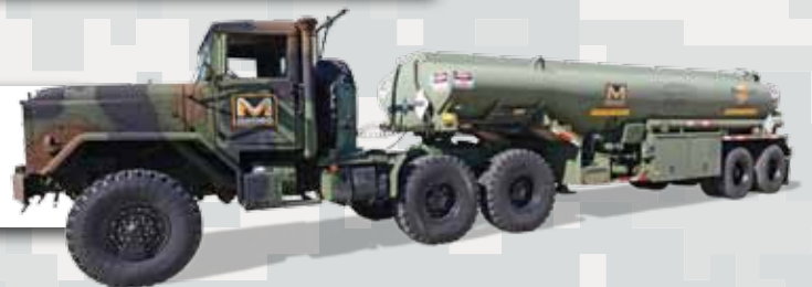
Military 6x6 Fuel Truck with self-contained 5,000 gallon capacity trailer (Six wheel drive). Self-contained generator powered high volume pumping system. High water / all terrain capable.