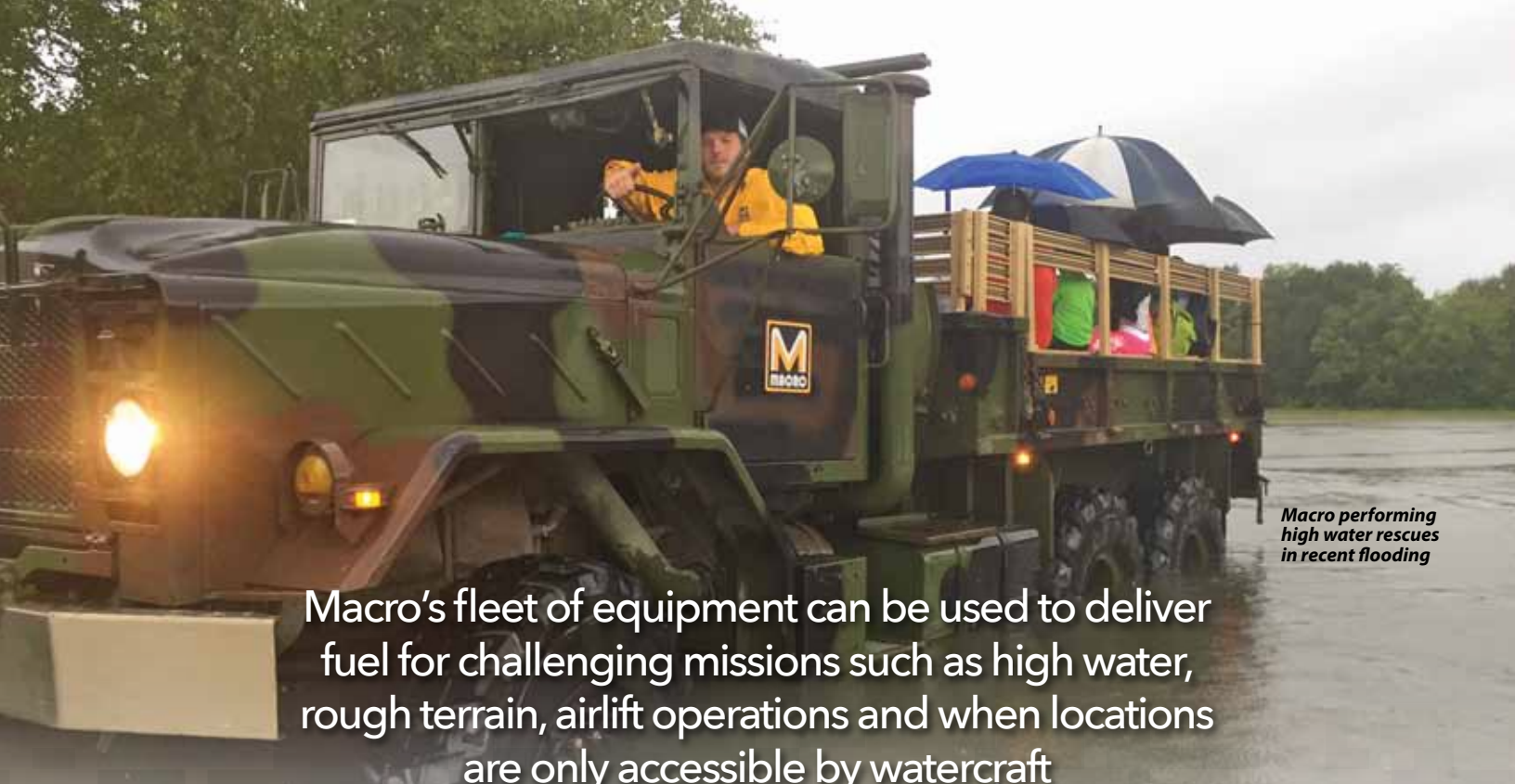
Macro performing high water rescues in recent flooding

Macro's fleet of equipment can be used to deliver fuel for challenging missions such as high water, rough terrain, airlift operations and when locations are only accessible by watercraft