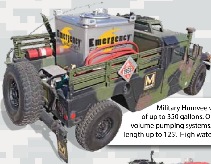
Military Humvee with fuel capacity of up to 350 gallons. One or more high volume pumping systems. Meter Register. Hose length up to 125'. High water / all terrain capable.