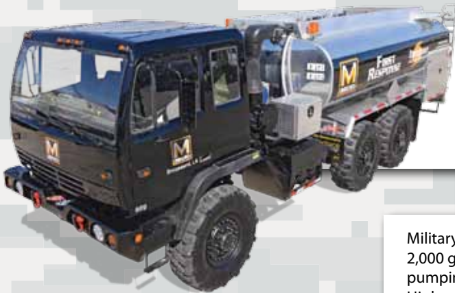
MTV Bobtail Fuel Truck all wheel drive with 2,000 gallon capacity. Multi-compartments capable of transporting diesel and gasoline. High volume pumping system. High water / all terrain capable.