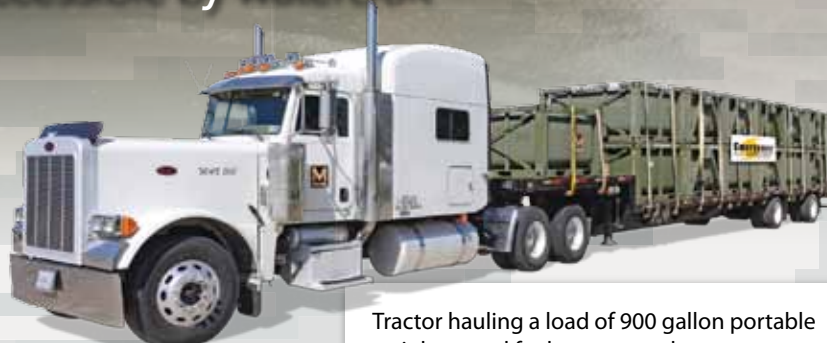
Tractor hauling a load of 900 gallon portable stainless steel fuel storage tanks.