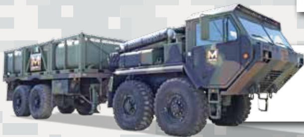
Military HEMTT Fuel Truck with 2,000 gallon capacity. High volume pumping system. All wheel drive. High water / all terrain capable.