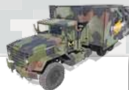
Military style Command Center with slideouts.