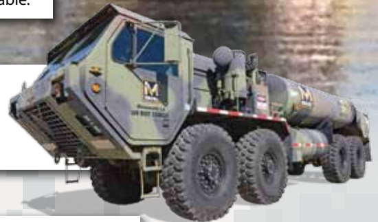
Military HEMTT Power Unit with trailer with up to 2,700 gallon capacity (Three 900 stainless steel tanks). All wheel drive. High volume pumping system. High water / all terrain capable.