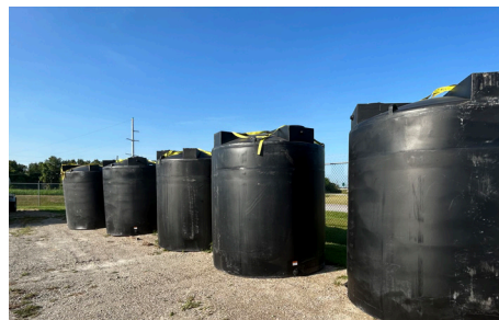
Poly storage tanks with 3,000 gallon storage capacity