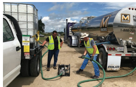
Transferring potable water directly into smaller water truck

If needed, Macro can deploy additional potable water trailers through its national subcontractor network.