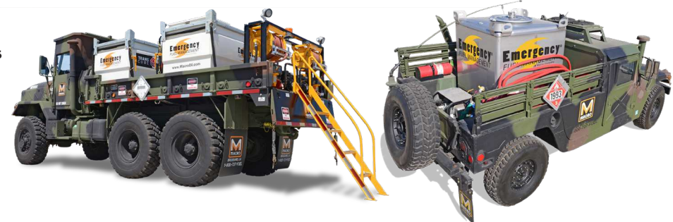
Military Humvee with fuel capacity of up to 350 gallons. One or more high olume pumping systems. Meter Register. Hose length up to 125'. High water / all terrain capable.