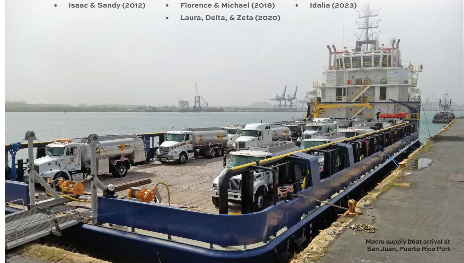
Macro supply boat arrival at San Juan, Puerto Rico Port