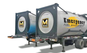
ISO tank on chassis with 6,000 gallon capacity.