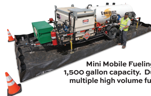
Mini Mobile Fueling Trailer 1,500 gallon capacity. Dual wall tanks, multiple high volume fueling points.