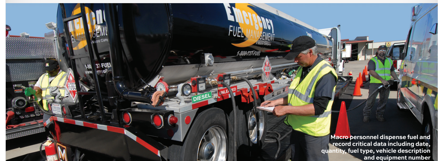
Macro personnel dispense fuel and record critical data including date, quantity, fuel type, vehicle description and equipment number