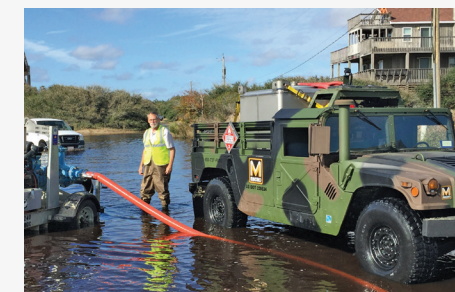
Military Humvee fueling water pump in high water conditions after Hurricane Florence in Outer Banks, North Carolina