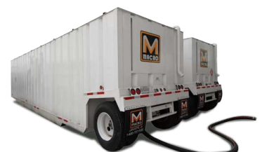
Frac Tanks with 22,000 gallon capacity.