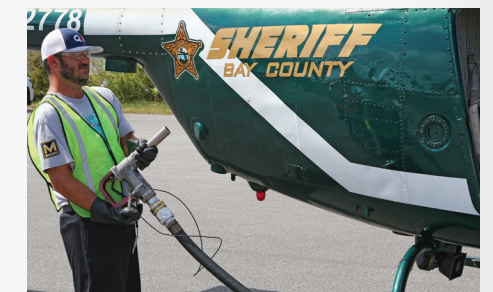
Sheriff's helicopter receives jet fuel following Hurricane Michael in Panama City, Florida