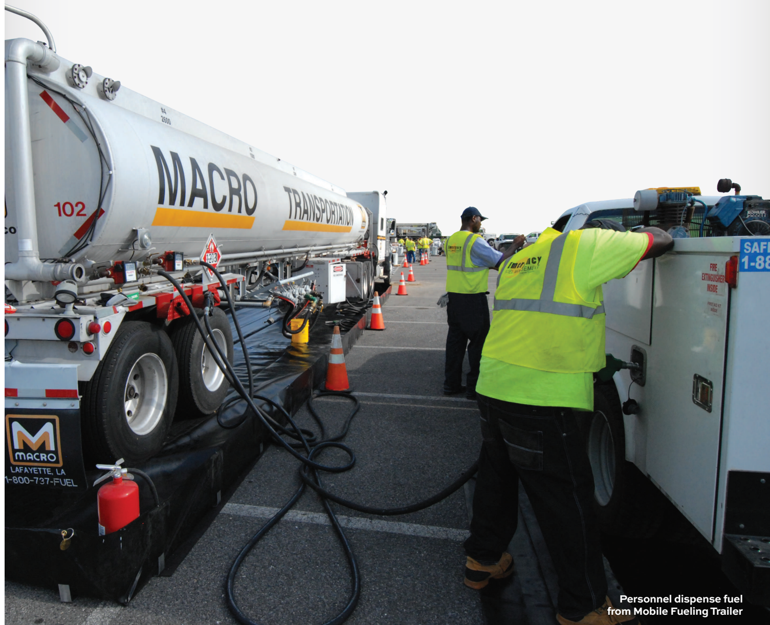
Personnel dispense fuel from Mobile Fueling Trailer