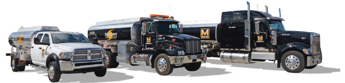
Bobtail Fuel Trucks with capacity ranging from 1,000 to 4,500 gallons. 1,100 gallon capacity. Multi-compartments. High volume pumping system.