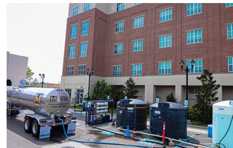
Delivering water to medical facility tanker, reverse osmosis system, potable water storage tanks