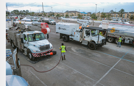
Fueling utility crew vehicles at a staging area post Hurricane Ida in New Orleans, Louisiana

Utility and Critical Infrastructure • Healthcare Facilities • Government - Federal, State, and Local Data Centers • Telecommunications • Commercial Businesses