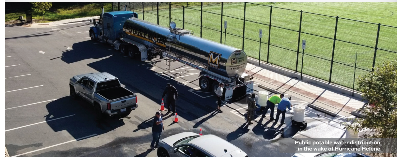
Public potable water distribution in the wake of Hurricane Helene

Provided potable water for healthcare systems across Texas & Louisiana