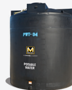
Temporary Storage Tanks